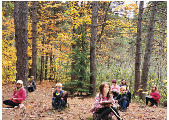
Copper Harbor School visits Bammert Farm.

New to eBird? Learn more about how to use it and sign up at https://ebird.org/home