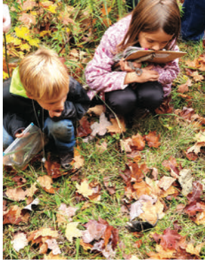
Copper Harbor School Students view a mole at GLC's Bammert Farm