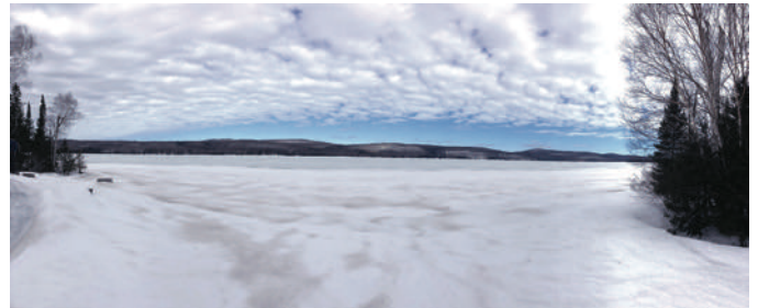
Little Gratiot River looking towards Gratiot Lake