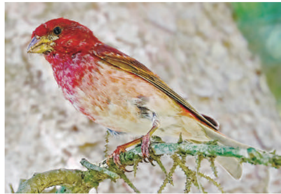
Purple Finch

A winter finch forecast can be found at https://finchnetwork.org/winter-finch-forecast-2020 .