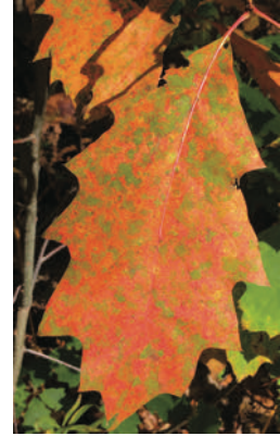
Red Oak Leaf